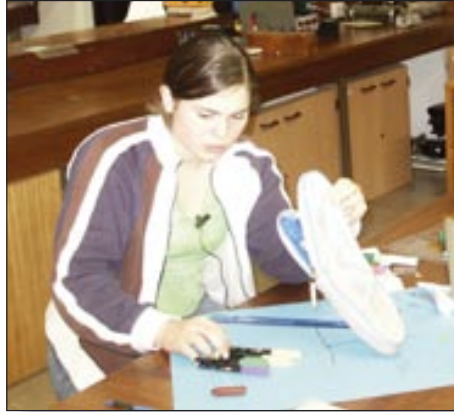
Figure 2: 'Miked-up' - digital recorders were used to capture some of the dialogue during ASCEND sessions

We also recorded some of the dialogue between students working together, to provide a record that would allow us to consider the level at which the students were working. Although space does not allow the inclusion of detailed accounts of all our observations, a few 'bites' have been included to give a feel for the way students were able to engage in and respond to the activities.