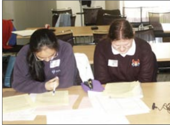
Figure 7: ASCEND was a chance to work with new friends from other schools

Part of the logic of working with several schools was to ensure there would be a 'critical mass'. By definition most schools only have a small number of exceptionally able students in a year group (indeed one of the Cambridge schools declined to participate on the grounds that it had no suitable students), and ASCEND would allow these to meet and work with similar-minded individuals from other schools. One of the complaints commonly heard from high-ability students is that 'friends who really understand us are few and far between'. 112