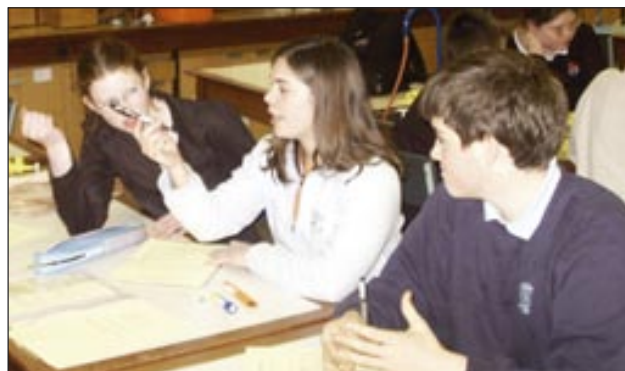
Figure 5: Making a point

Classroom talk can be a major means by which learners share, develop and challenge ideas. This relies upon the talk being on task, and at a sufficient level of sophistication. In particular, talk that supports effective learning will have a ‘dialogic’ nature, that is it will be about sharing perspectives, and questioning and exploring ideas, rather than ‘telling’. Effective science teachers ensure that this type of talk features in classroom dialogue. 66 When students are encouraged to engage in this type of talk, that facilitates learning, they are able to demonstrate their potential for thinking about ideas in science. 67