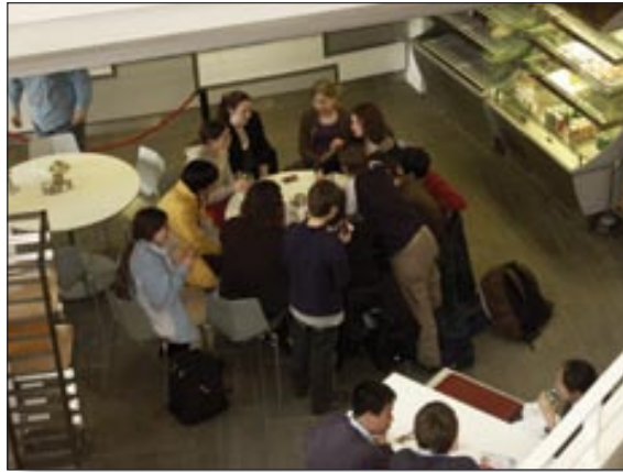
Figure 8: Refreshments (and socialising) during the registration period at the start of an ASCEND session.

The group then moved to teaching accommodation for a ninety-minute academic session. The sessions were led by the author, supported by a team of teaching/research associates, with school science staff having an open invitation to attend and become involved. The Faculty teaching team were all science education specialists – science teachers in training, or graduate research students.