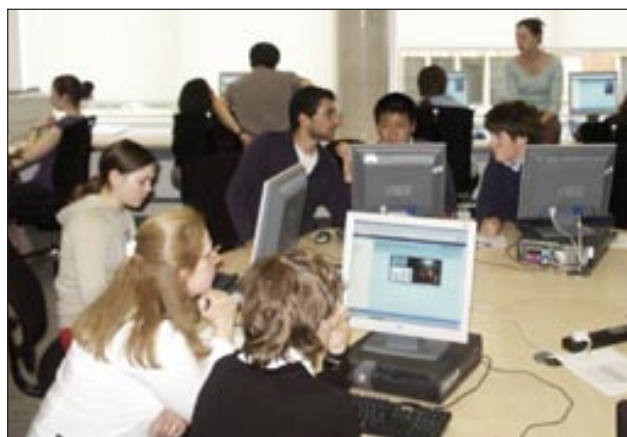
Figure 11: Working with Level 3 (A level) Physics materials

Comparing two particle models, and two models of ionic bonding, in terms of how well they can explain phenomena / properties