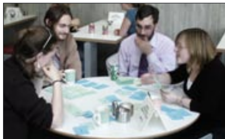
Figure 4: The analogy game: not just challenging the students!

Work for the gifted should offer them the chance to produce some type of outcome. This will be an authentic activity if there is a genuine audience for the product. 60