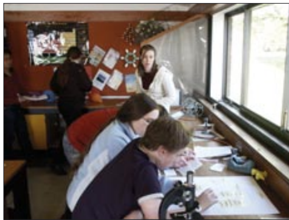
Figure 9: Support was available for students – when needed

The group then moved to teaching accommodation for a ninety-minute academic session. The sessions were led by the author, supported by a team of teaching/research associates, with school science staff having an open invitation to attend and become involved. The Faculty teaching team were all science education specialists – science teachers in training, or graduate research students.