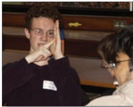
Figure 6: Explaining to peers

This could indeed be seen as a means of structuring learning to enable informal peer tutoring, where students teach each other. If peer tutoring were simply seen as making use of the presence of more advanced students to help their less advanced peers, then this would be a questionable activity: children go to school to learn, not to teach. However, teachers' own experiences suggest that they can develop a much deeper understanding of their subject through the process of preparing to teach others, and having to explain an idea carefully to another who does not yet understand it can certainly be the basis of a useful learning experience.