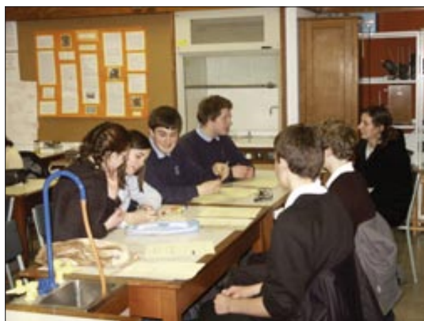
Figure 10: Students were encouraged to work in mixed-gender groups

A group size of around four was employed. In order to encourage mixing, it was specified in the first few sessions that each group should include (a) both genders, (b) students from more than one of the schools.