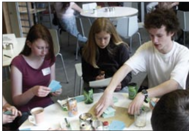
Figure 3: Creating new links: the scientific analogy gam

offering opportunities for learners to make connections across disciplines as well as across topics. 54