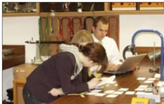
Figure 1: Students were carefully observed during ASCEND

In particular, it draws upon a project supported by SEP (the Science Enhancement Programme), to design and implement a programme of after-school enrichment activities for Y10 (14-15 year olds). The ASCEND project (Able Scientists Collectively Experiencing New Demands) was a collaborative project involving the University of Cambridge Faculty of Education working with the Confederation of Secondary Schools in the City of Cambridge. Students from four of the City schools came together in the Faculty of Education to work together on a series of activities designed to complement school science provision. Funding from SEP supported the development of new teaching resources (made available with this publication) as well as the logistical support for the research/development project. The project was staffed by science graduates studying in the Education Faculty, who acted both as teaching assistants and also as research assistants recording their observations on the sessions.