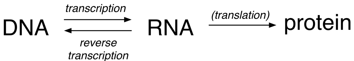
Figure 2: The model of information transfer in molecular biology has been amended now it is known that information in RNA can sometimes be transferred to, and so stored in DNA, before later being used in producing proteins

The model proposed was actually more subtle than shown in figure 1 (Crick, 1970), but came to be widely understood as suggesting information only flowed from DNA to RNA, and then to protein - with no exceptions. It is now known that some viruses (including the HIV virus associated with the disease condition AIDS) use an enzyme called reverse transcriptase to modify cellular DNA in host cells, so that they become factories (sic, notice the metaphor there) for producing the materials needed for the virus to reproduce. The viral RNA codes for new cellular DNA, so information can pass either way between DNA and RNA (see figure 2). The central dogma - a model that was often assumed to be realistic - prevented some scientists looking for these kinds of effects for some years.